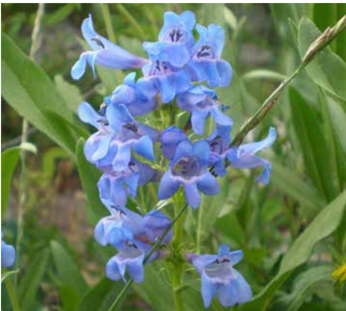
Penstemon saxosorum Routt County