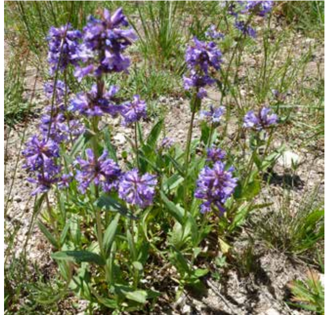
P. rydbergii v aggregatus , large corolla, Highway 43, Trail Creek ID MP 8 (Maffitt)