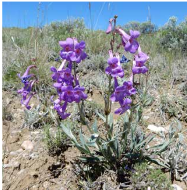
P. secundiflorus North Park (Mike Kintgen)

If spring weather conditions cooperate, Mike Kintgen will open his private garden 35 miles north of Steamboat Springs. Mike will not be able to determine if it will be open until sometime in May when the snow melts. This garden lies at 8,200 feet (2500m) and houses hundreds of species that are adapted to the short growing season.