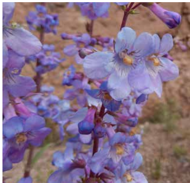
Pentstemon osterhoutii Eagle County, CO

For those of you who aren’t familiar with this type of discussion forum, it’s a group of people who join together online via email to discuss a particular topic. For us, it’s a chance to discuss everything to do with penstemons. Google Groups is one type of discussion forum, and it’s the one I chose to use. The name of the group is, just, “penstemon.” To become a member, and I hope you