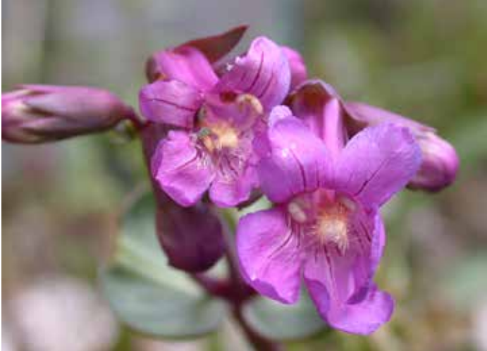
P. oosterhoutii , trough, 4-2007 (Maffitt)

Some of the penstemons that are expected to be seen in the upcoming APS field trips near Walden CO.