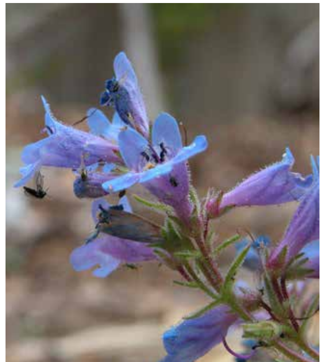
Penstemon virens (Gary Monroe)