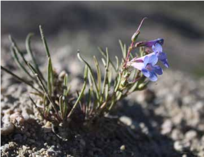
P. penlandii